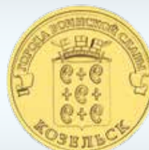
№ 4 (29) (November 2014) – commemorative coin “Kozelsk” (The Cities of Military Glory)