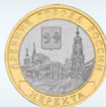
№ 1 (30) (February 2015) – commemorative coin “Nerekhta” (“Ancient Cities of Russia” series)